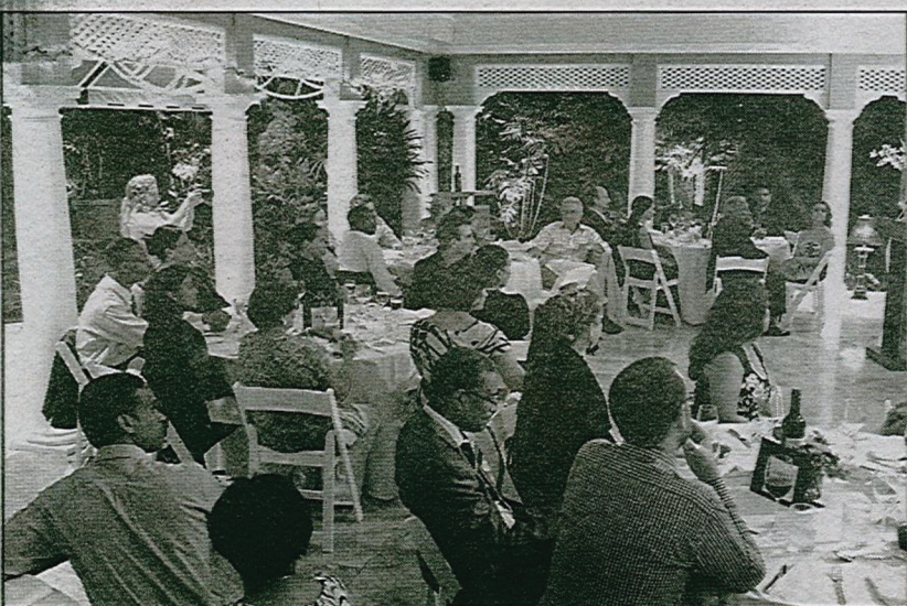
Above: Guests and participants enjoy the dinner.