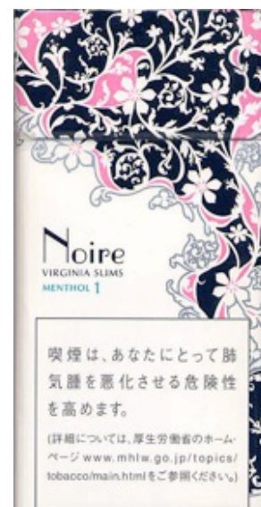
Virginia Slims Noire cigarettes by JTI (Japan)