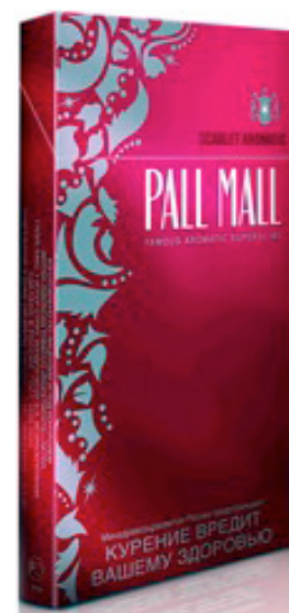
Pall Mall Scarlet Aromatic cigarettes by BAT (Russia)