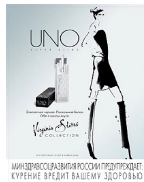
Advertisement for Virginia Slims Uno cigarettes by JTI (Russia)