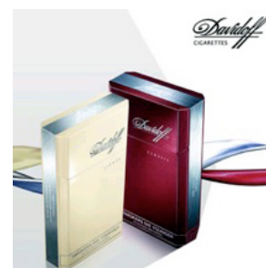
Davidoff cigarettes by Imperial Tobacco